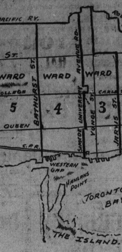
HOW CITY IS DIVIDED FOR ALDERMANIC ELECTIONS.

John Kay, Son & Co. 36 and 38 King Street West LIMITED