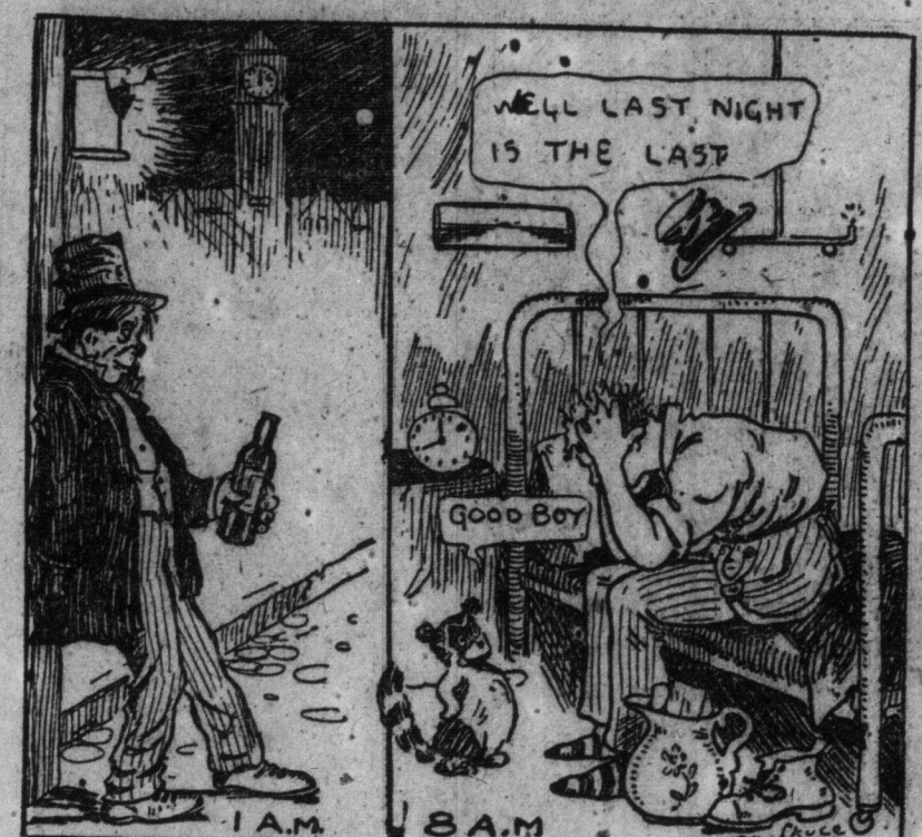
TORONTO WORLD'S PROVERB PICTURE NO. 57