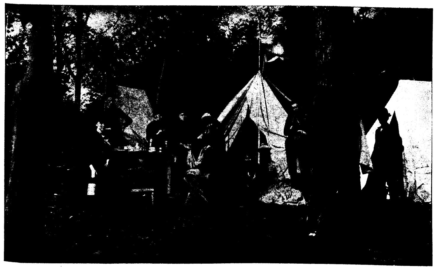
A CAMPING PARTY AT BUCK ISLAND.