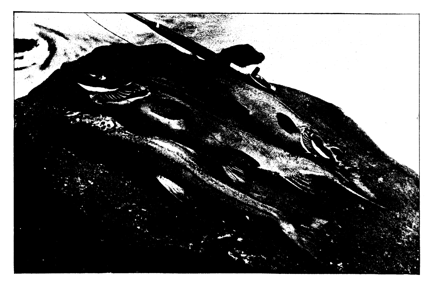
THE WINNINISH, OR LAND LOCKED SALMON.