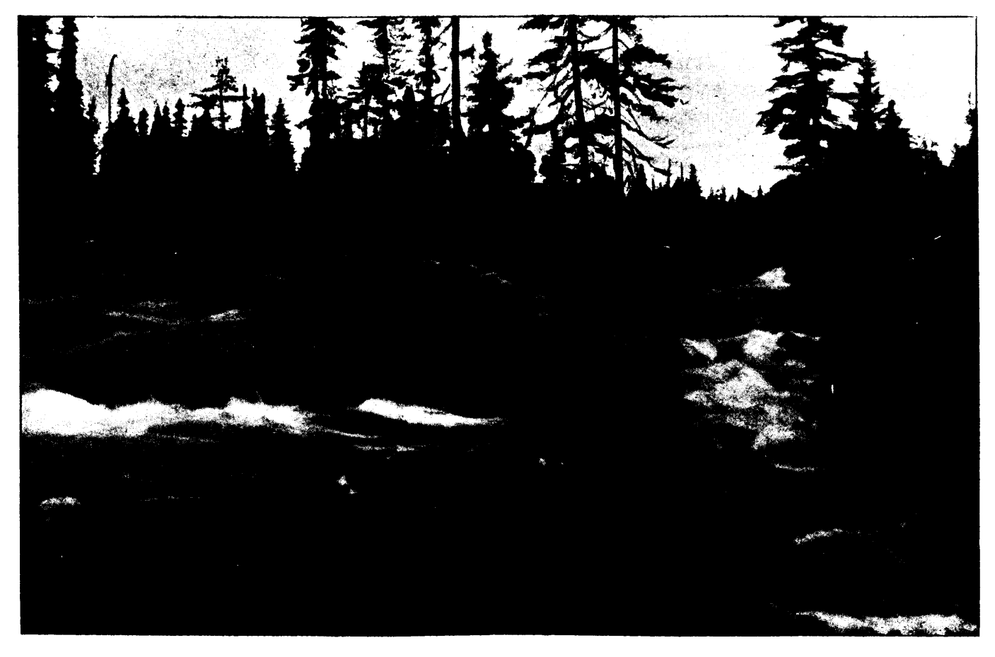
THE JEANNOTTE RIVER.