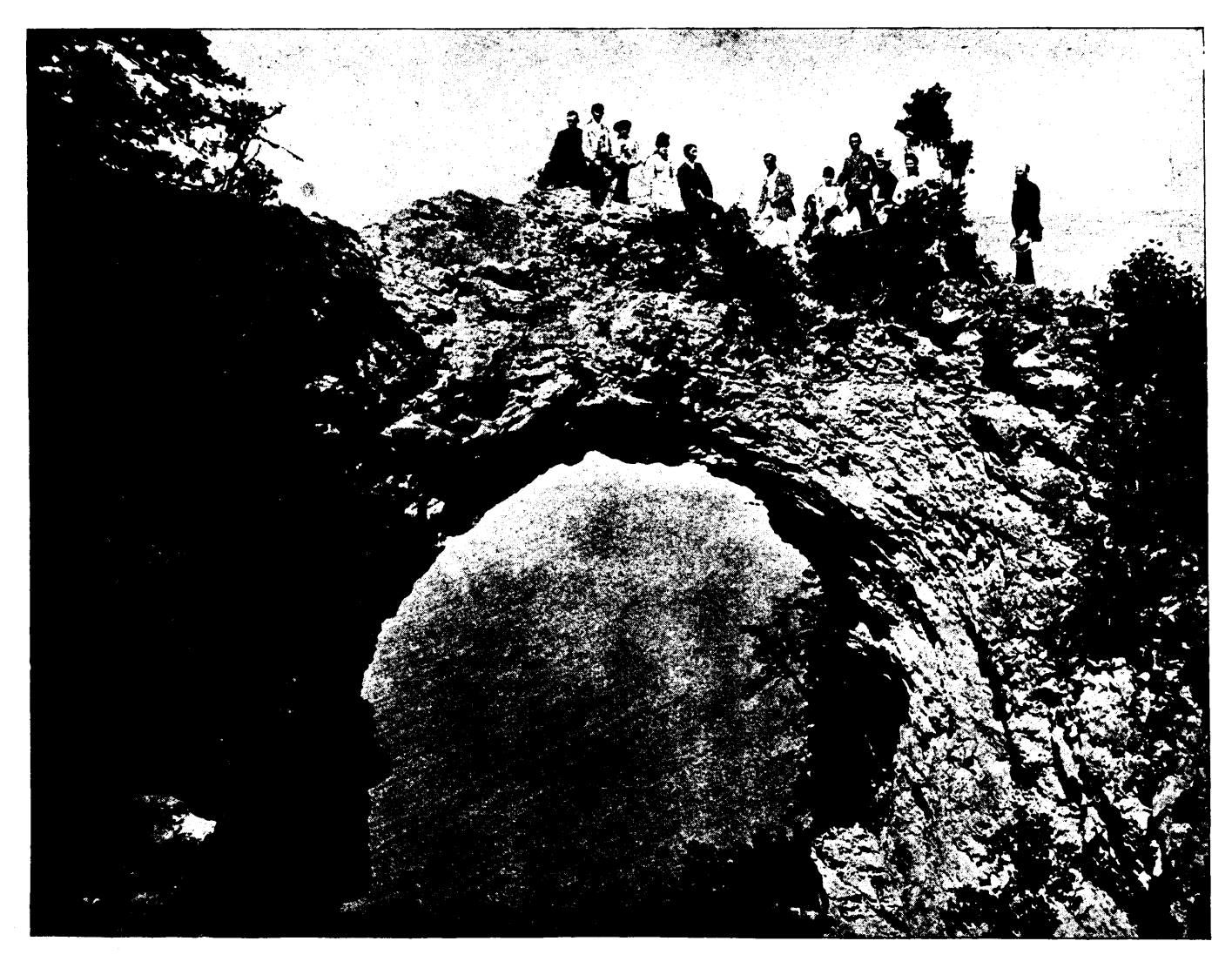
ARCH ROCK, Mackinaw, Lake Superior.