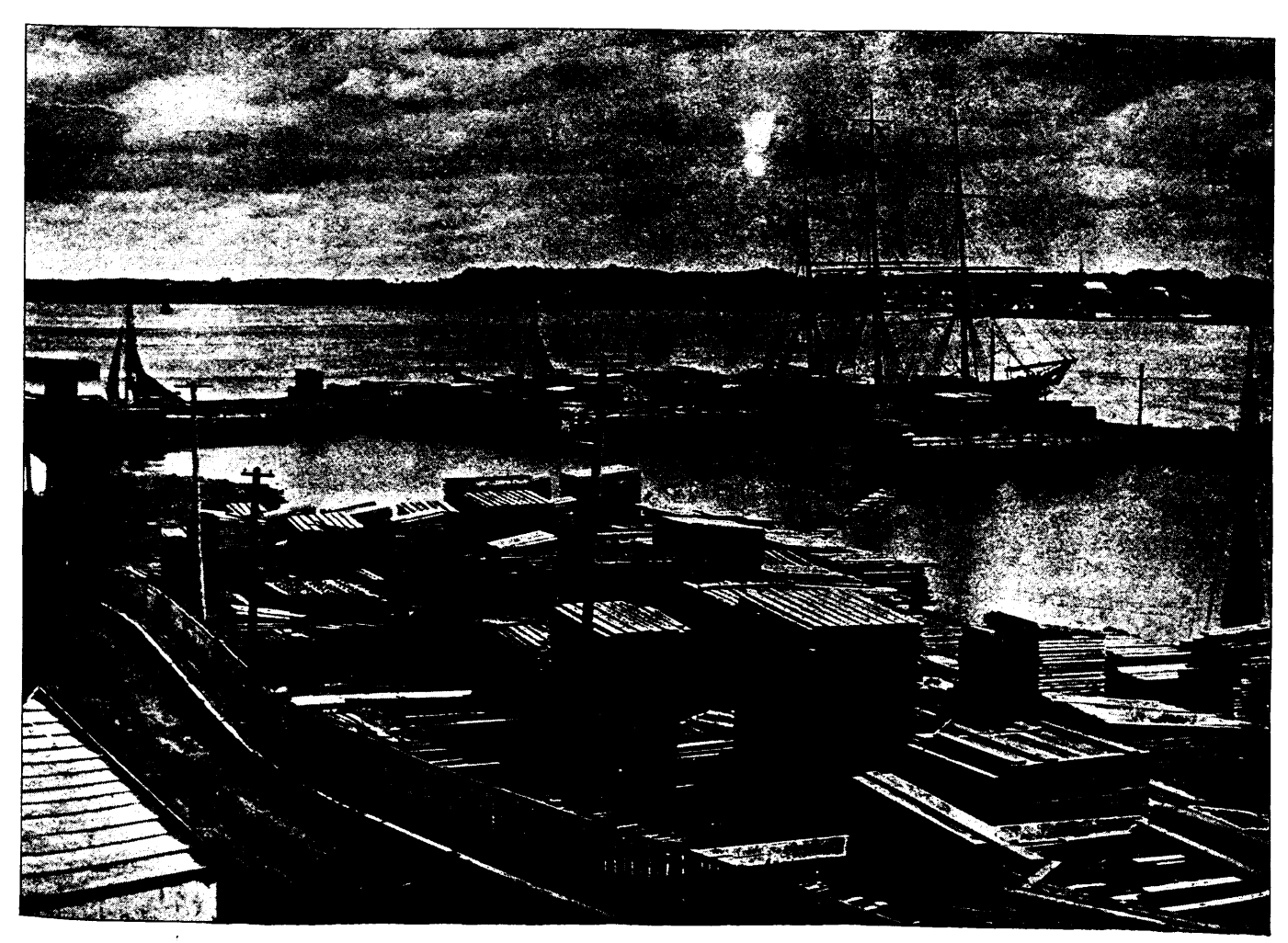
BRIDGEWATER COVE, NEAR QUEBEC.