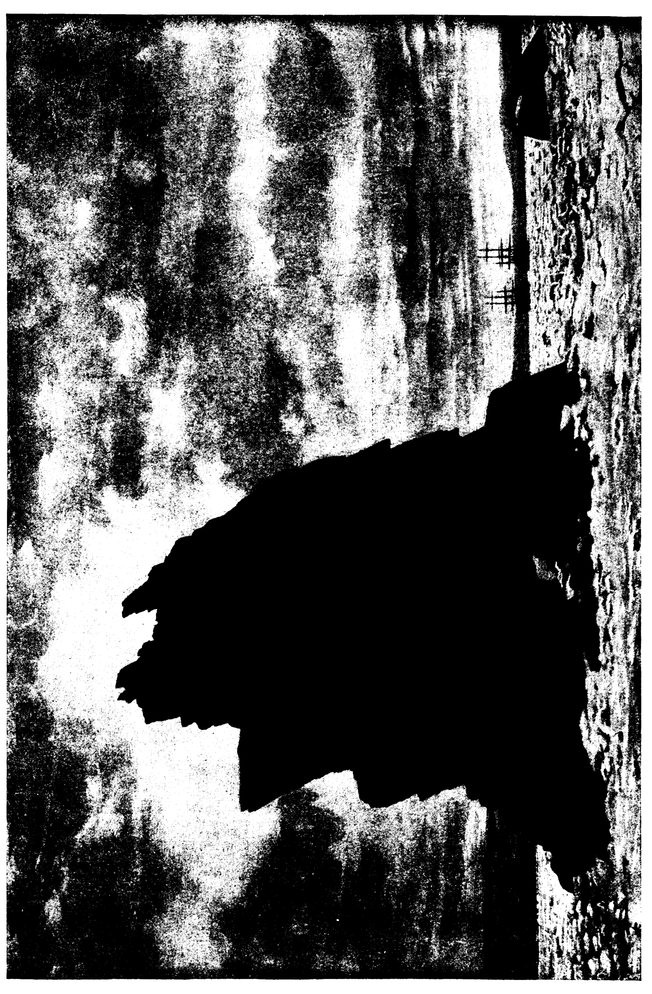
SALVAGE ROCK AND SEALING STEAMERS, HARBOR GRACE,