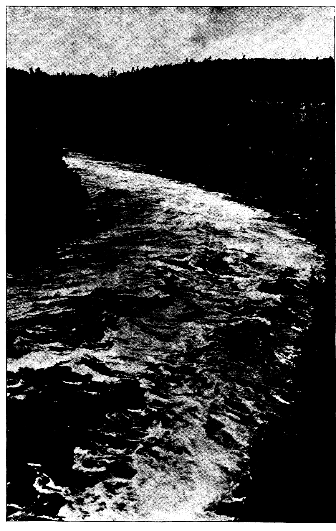
T\;H\;E W\;H\;I\;R\;L\;P\;O\;O\;L , N\;I\;A\;G\;A\;R\;A . From a photograph by Zybach.