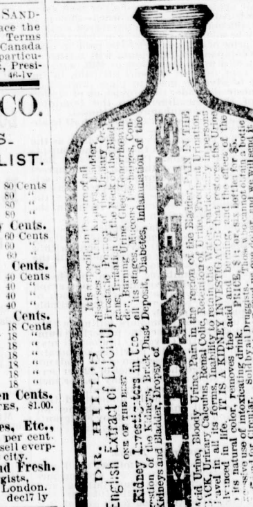
Elliot & Co., Toronto, and B. A. Mitchell London, wholesale agents.

Prepared by Dr. J. C. Ayer & Co., Lowell, Mass. SOLD BY ALL DRUGGISTS EVERYWHERE.