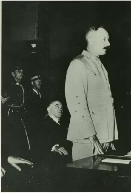
Le général Henri Giraud et Mackenzie King participèrent à une conférence de presse le 15 juillet 1943 lors de la visite du général à Ottawa.