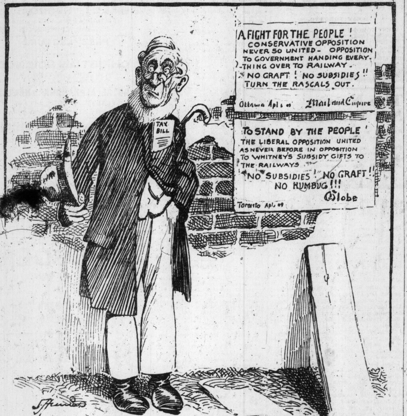
THE COUNTRY: I wonder why in thunder the politicians only git virtuous when why they git helpless?