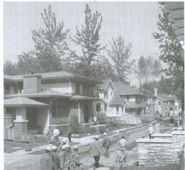
Ekistics' Street of Dreams project in Beijing

continued on page 5 — Canadian architects