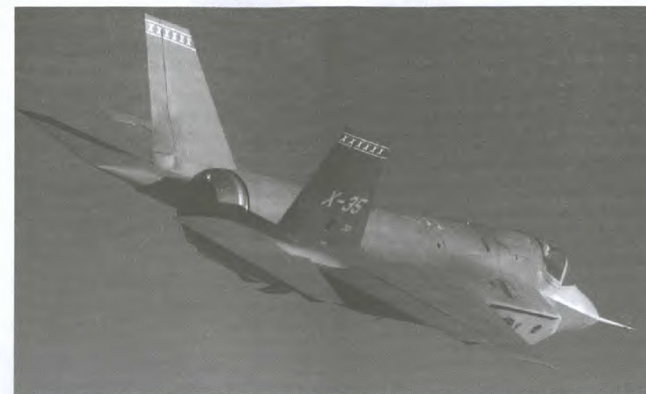
New Brunswick's Applied Courseware Technology won a contract with Lockheed Martin's $270 billion F-35 Joint Strike Fighter project.

When the company began expanding into the U.S. and Europe, ACT