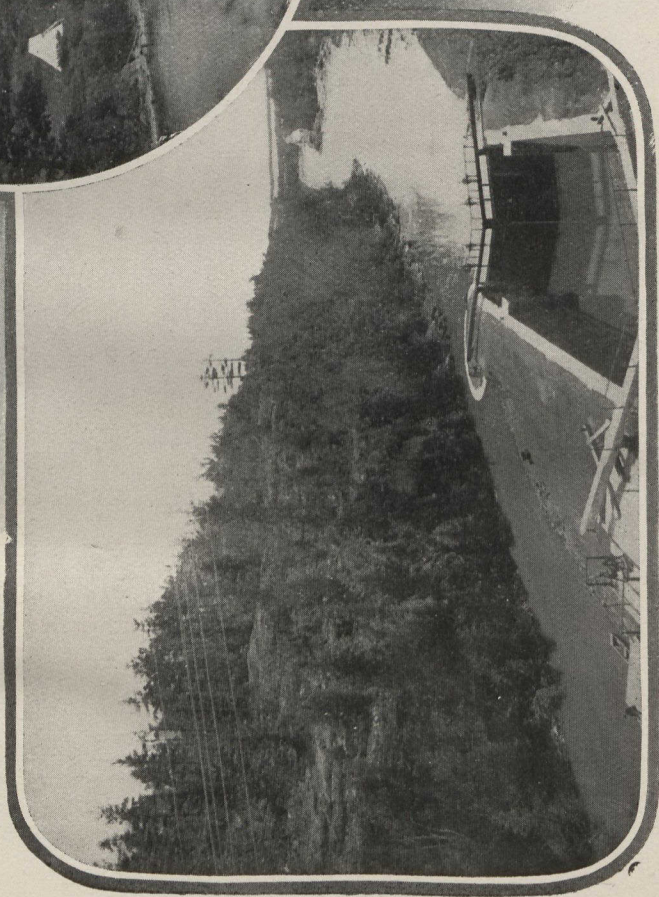
Views of Kingston Mills.