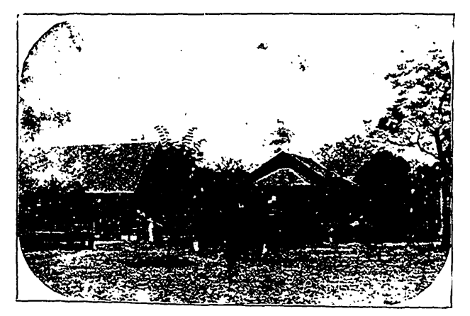
CHAPEL AND DISPENSARY.