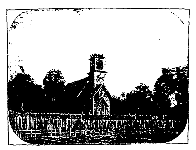
MISSION CHURCH, CHIENG MAI, LAOS COUNTRY.