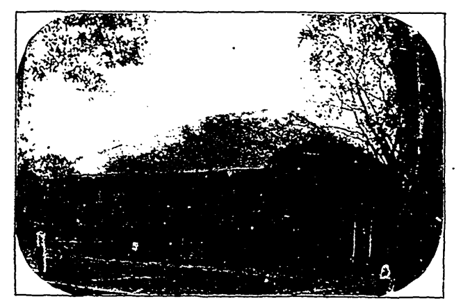
MISSION PREMISES, CHIENG MAI.