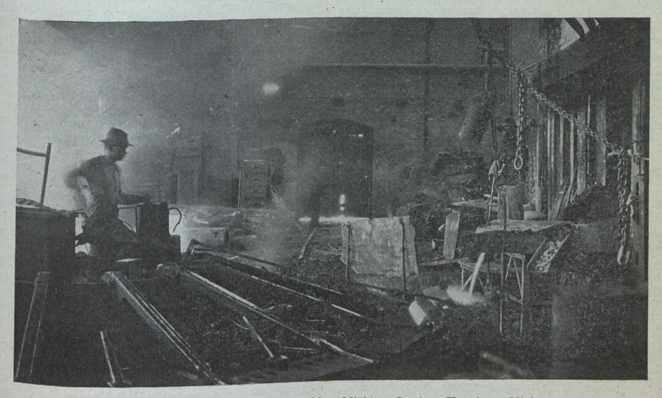
Furnace and Walker Casting Machine, Michigan Smelter, Houghton, Mich.

A smaller, but important, quantity of copper is obtained by treatment of the reverberatory slag. This is allowed to cool in deep pots and the copper settles to the bottom. The buttons are broken off and returned to the reverberatory furnace, while the slag, containing 15 to 30 per cent. copper, is melted in a cupola furnace with suitable fluxes. Limestone is added for all slags. For the ferruginous slag from conglomerate ore, a siliceous flux is necessary, and for the siliceous slags from amygdaloid ore, ferruginous fluxes must be added. Anthracite is added as a reducing agent. The fuel is coke and the anthracite.