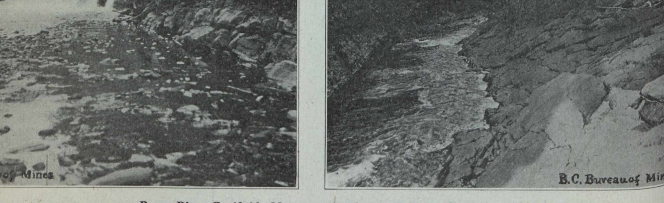
Peace River Coalfield-Measures showing on Johnson Creek.

One report was to the effect that gold had been found on Willow river, low down toward its confluence with Fraser river. Another gave the neighborhood of Quesnel as the scene of a new discovery. As both rivers flow through country in which much gold has been recovered over a long period of time, it is, of course, quite possible that new finds may be made, but it is a fact that notwithstanding its having been prospected by numbers of the old Cariboo miners little pay ground was found well down Willow river, so old-timers are not yet attaching much importance to the reports so far as that stream is concerned.