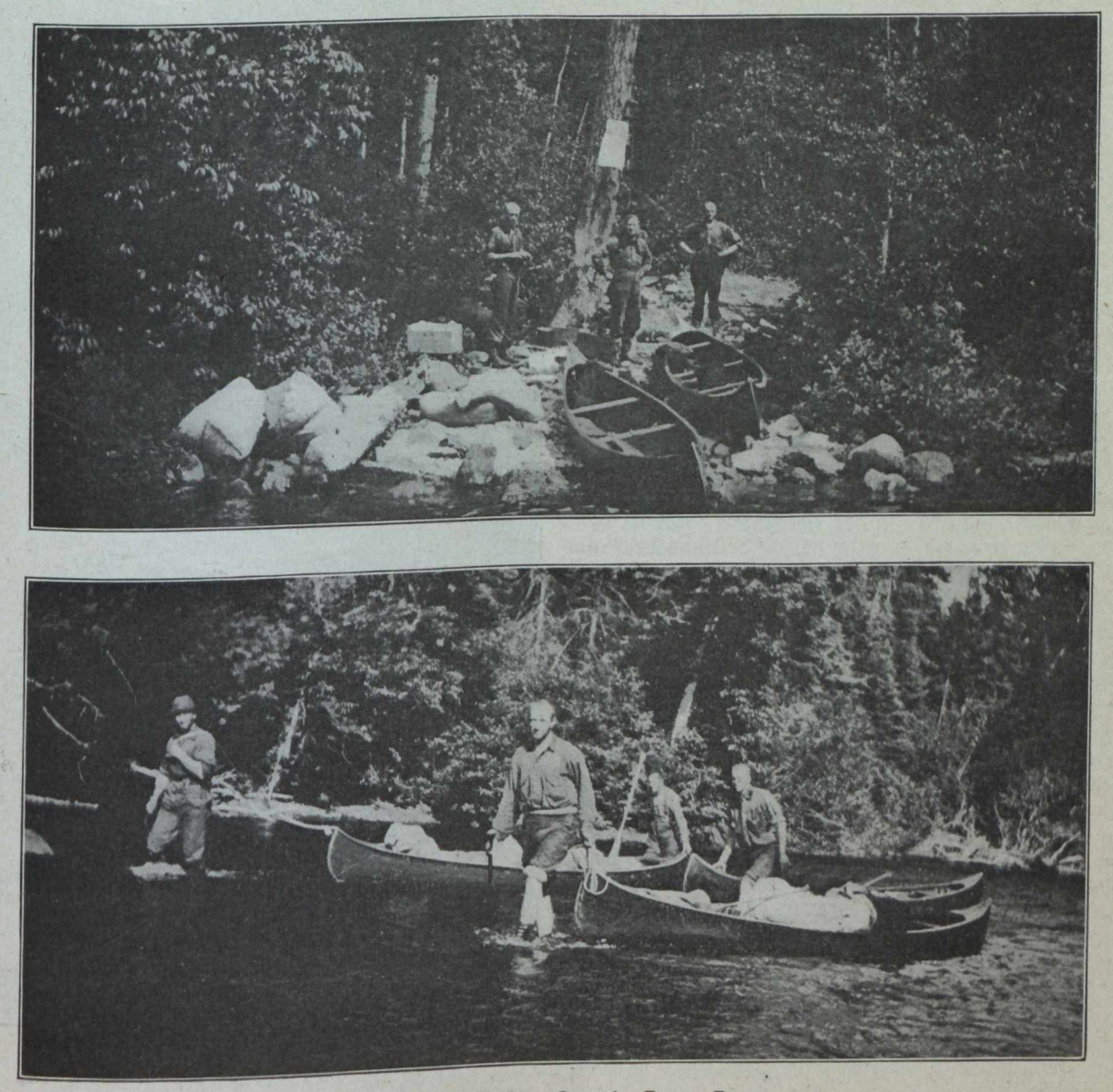
Scenes on a Northern Ontario Canoe Route

There have been gains within the past six months. At the Kerr Lake one or two small veins of good ore not hitherto discovered have been unearthed under