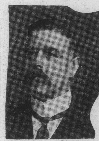
HON. F. J. FULTON.