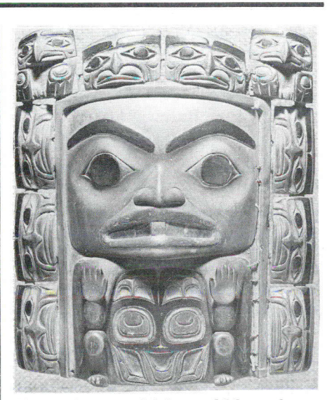
Head plaque, which would have been worn by a member of the Eagle clan.

The Children of the Raven hall presents a series of ancient, complex and