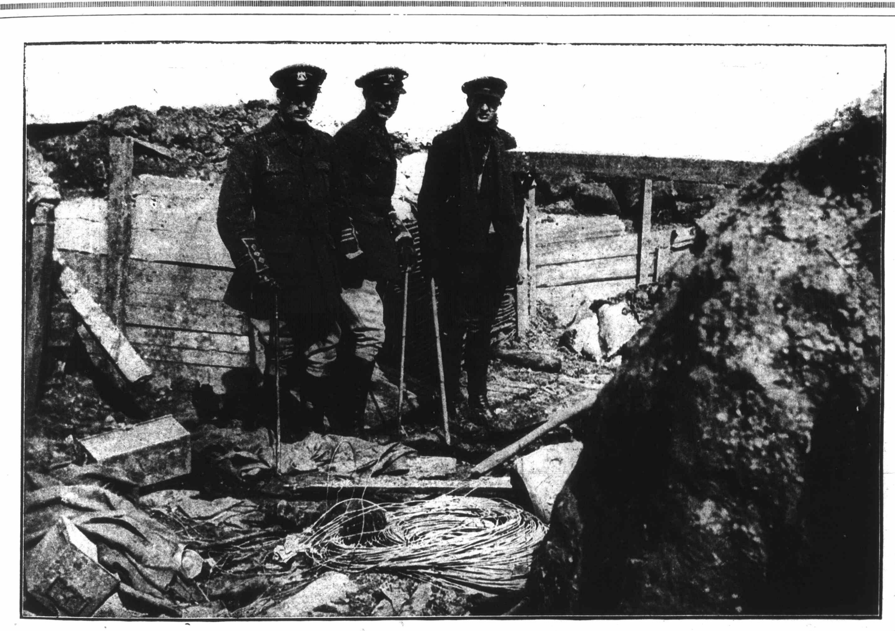
BRITISH OFFICERS EXAMINING A DESERTED GERMAN TRENCH.

(1) Heavy clouds of superstition and infidelity darken the God-given light. Men dull their consciences with outward form and ceremony in place of heart service. A great monarch striving after