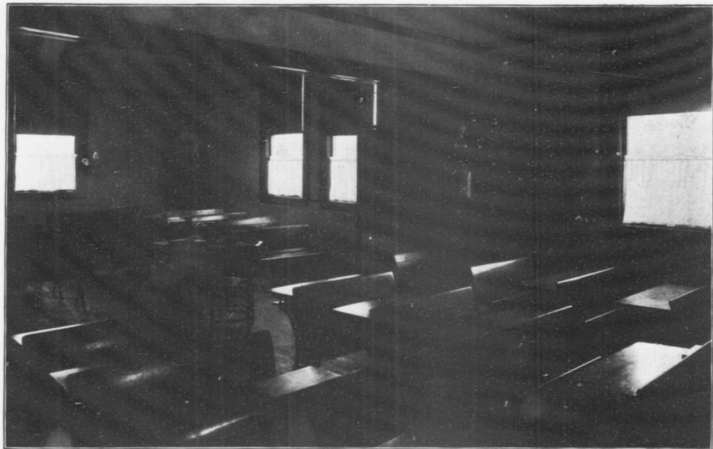
SENIOR FORM ROOMS