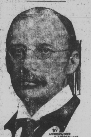
SIR CECIL ARTHUR SPRING-RICE Successor to the Rt. Hon. James Bryce as Great Britain's ambassador to the States.