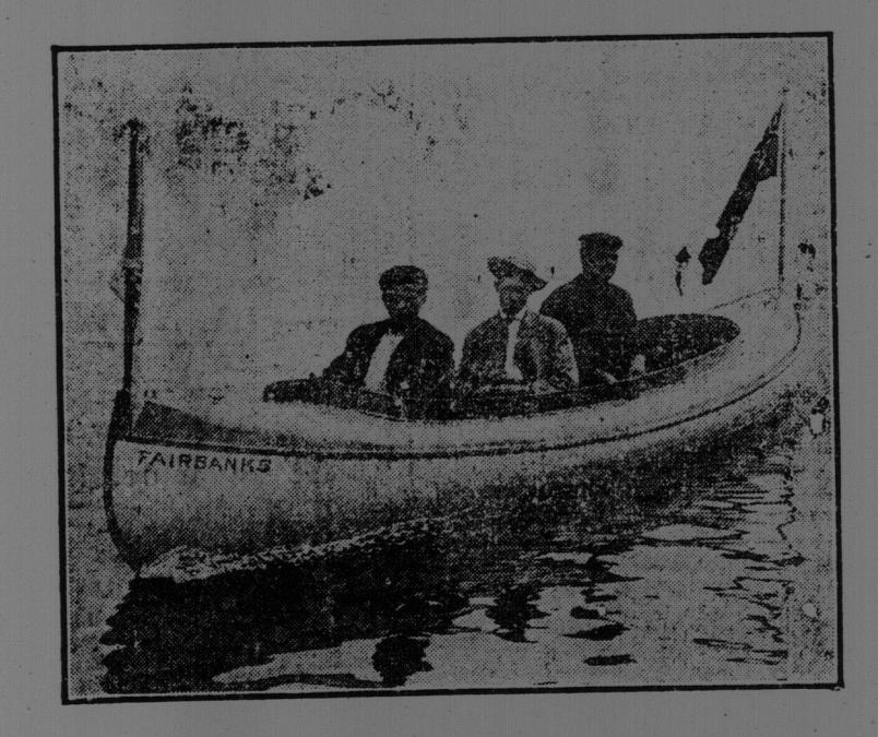
Fitted With Fairbanks-Morse Marine Engine On Exhibition at the Store of THE CANADIAN FAIRBANKS CO., Ltd., 71 PRINCE WILLIAM STREET

FOURTH GRAND PRIZE $350 Chestnut Motor Canoe