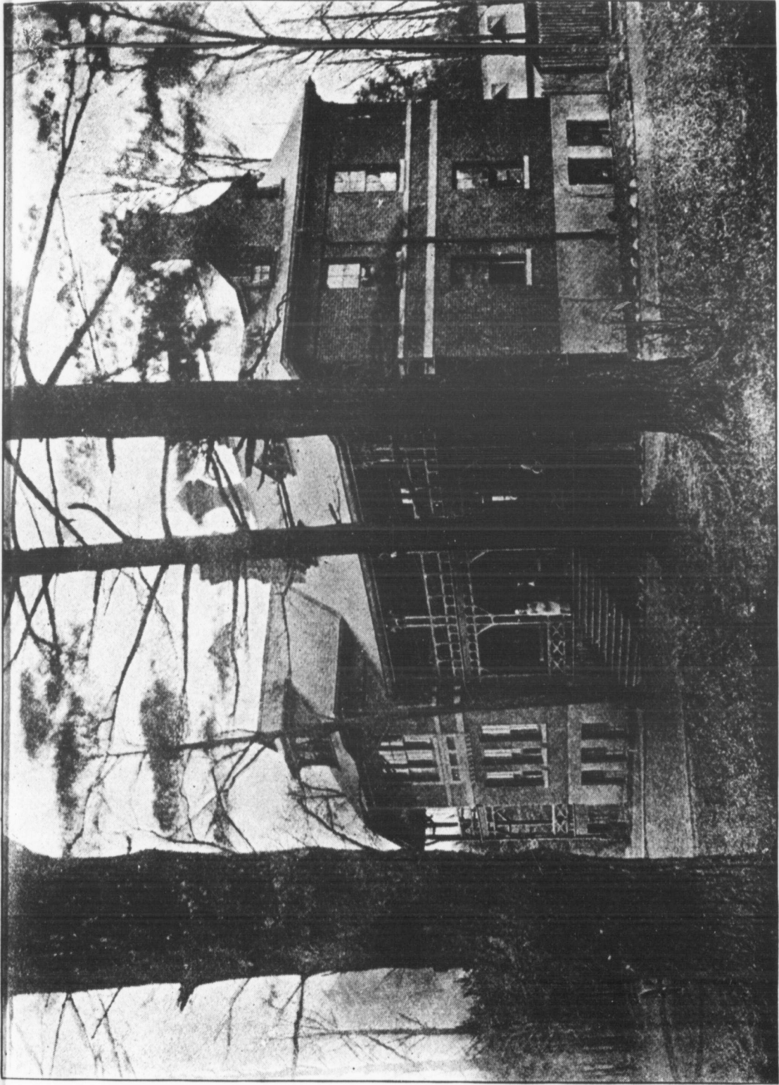
HILLCREST CONVALESCENT HOME, WELLS' HILL, TORONTO.