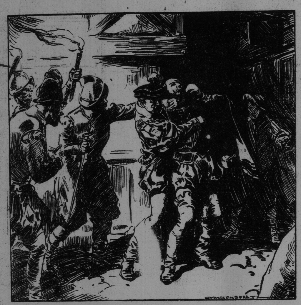
"Well Caught!" cried Vigo.

Will Be Published in This Territory Exclusively By THE EVENING TIMES. The Opening Chapters Will Be Given