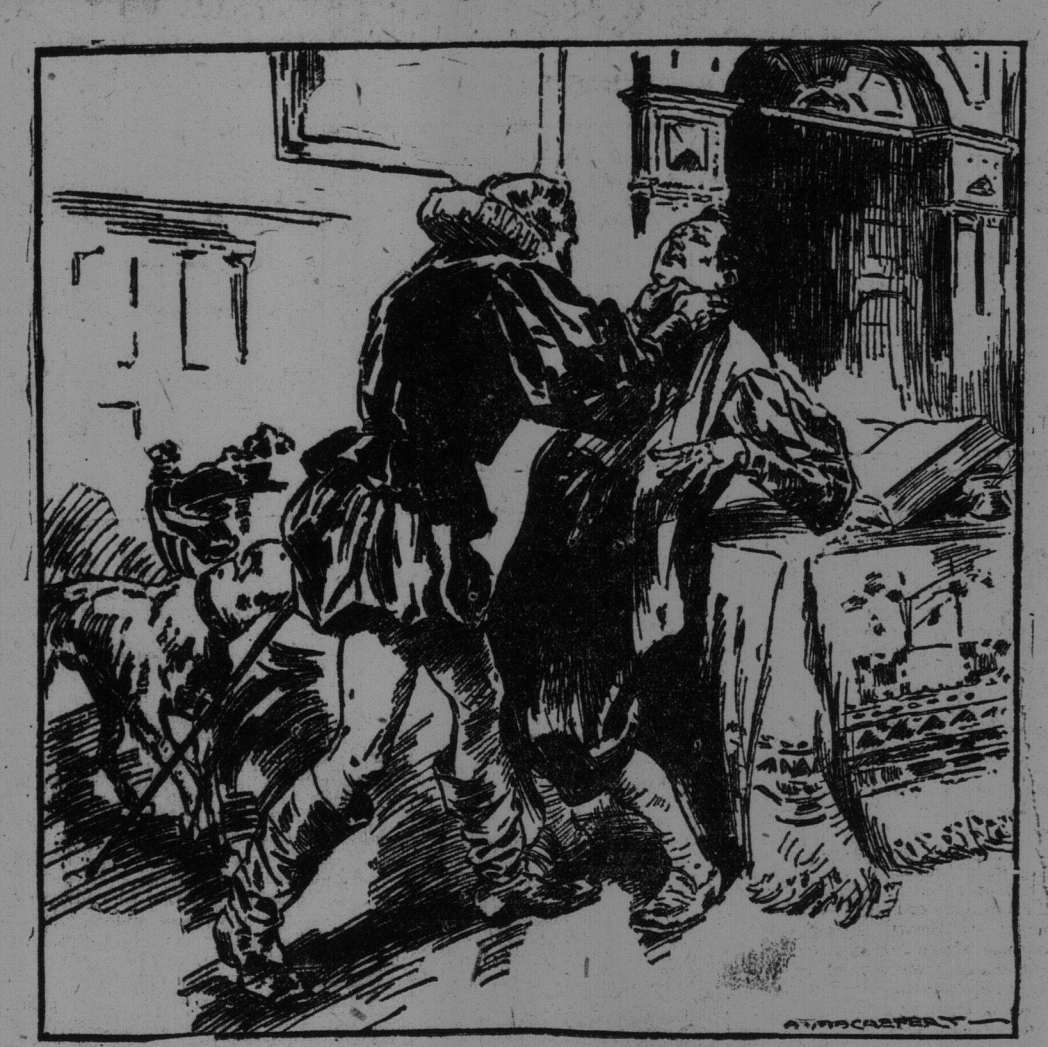
With a cry Monsieur sprang toward me. "You lie you cur!"

A fascinating tale of love and adventure. Now appearing in one of the great metropolitan dailies. The story that "caught" the city of New York.