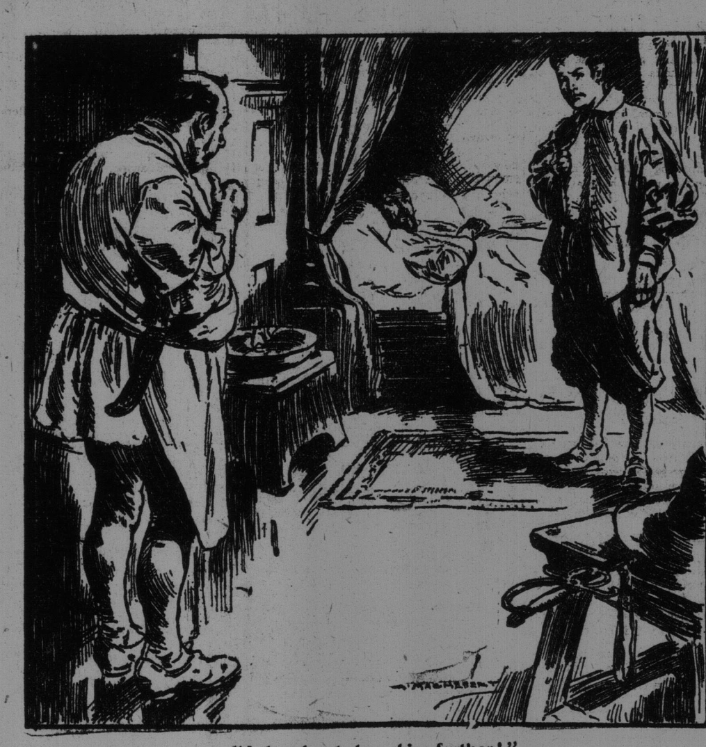
"I dared not deny him further!"

Don't fail to absorb the opening installment of this famous story, commencing Saturday, May 5th.