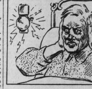
IS IT ELECTRIC?

Best for light colds. Best for heavy colds. Best for sore throats. Best for coughs. Best for chest ailments. Best for all respiratory troubles. Ayer's Cherry Pectoral.