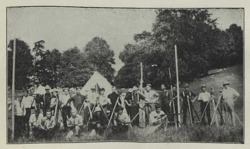
THE ENGINEERING FIELD CAMP.