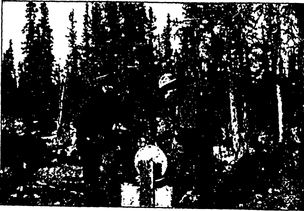
The Missionary turns the Grindstone.

The greatest opportunities for dropping seed come by the wayside. Such scenes as below, "an axe to grind," come, and I know from the man's own lips the uplift that the chance conversation of a few minutes gave his life. The successful missionaries here are the men who can with tact and kindness use these chances.