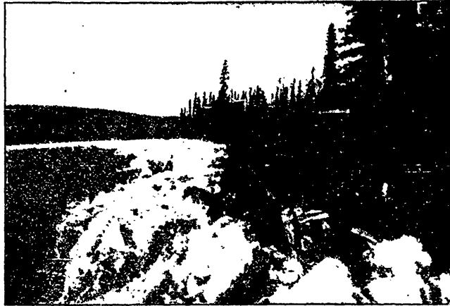
They Would Like to get Across.