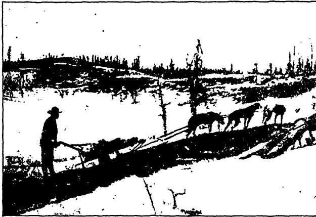
Wheeling up a Bare Slope.

For sixty-five miles over the "cut-off" there are many great hills to climb—the southern slopes of which are bare of snow as in summer. These sides he had to climb on the way north, so he conceived the plan of fitting a pair of wheels about the middle of the sled, just balancing it, and lifting it a couple of inches off the ground, enabling him to send his team over bare spots without that exasperating screech when iron strikes gravel. The wheels were so fixed that they could be removed or attached in a few seconds.