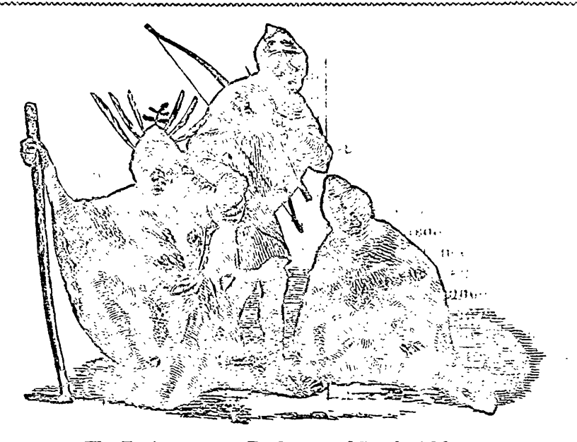
The Bosjemans, or Bushmen of South Africa.

Some of my young readers will have lizards, serpents, ants, and grasshopheard, and some perhaps seen, some pers. very curious people exhibited in Lon- and there are some kind of plants the don, and called Bosjemans or Bush-They come from South Africa, and are probably the lowest class of human beings in the world. It is amongst such people as these that Mr. Moffat labours, and I have thought some account of them would not be out of place in your little Paper.