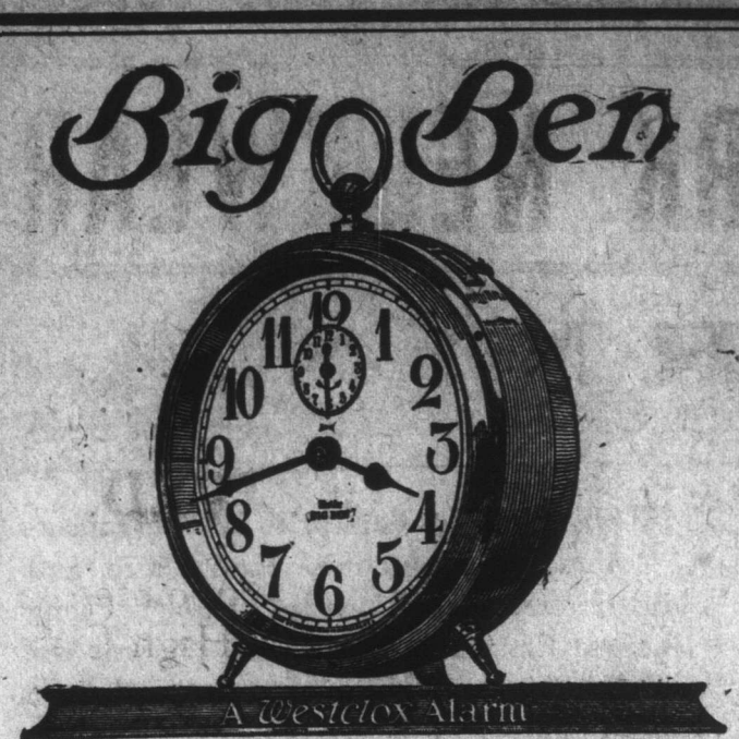
FIG BEN is a house-hold word because he's a clock of his word. He runs on time he rings on time, he helps folks live on time. *

Ail Westclox Alarms run true and ring true. They're all good looking, too. You can tell them by the family Your name, Westclox, on the face. is $4.00.