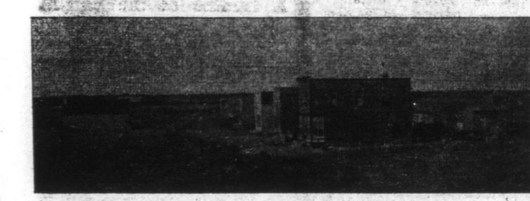
Irma Ten Months Ago.

No better looking land is to be seen rival of the steel last summer by a along the line of the Grand Trunk few months. In August, 1908, the Pacific Railway than that in the Irma first building on the townsite was district. It has been estimated that erected as a general store by Charles 97 per cent. of the land within a rad-swales, the first postmaster of Irma. lus of twenty miles of the town on From Edmonton, Irma is 109 miles the north, west and south, and east to distant by rail. Wainwright lies 17 the Battle river is fitted for agriculmiles to the east and Viking, the near-ture. The soil is medium heavy. A est town to the west, is 27 miles away. drift of light sandy loam close to the Irma is thus very favorably located railway grade belies the character of the point of view of trade. The the country a short distance back.