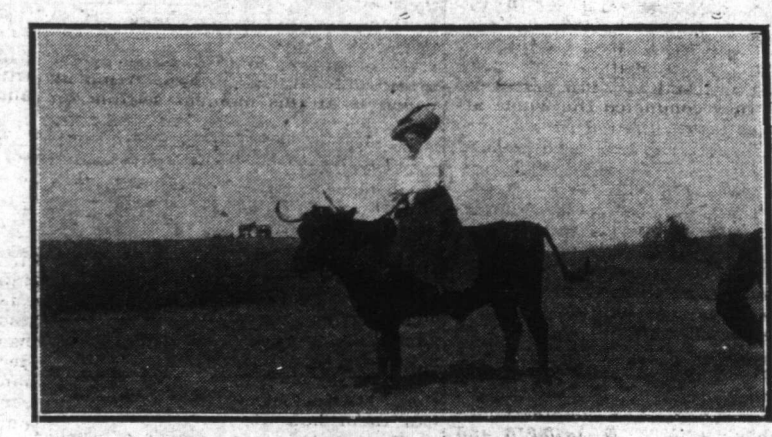
A Fair Maid of Irma.

Has Good Water. The town finds a plentiful supply f water at no great depth. It is hard