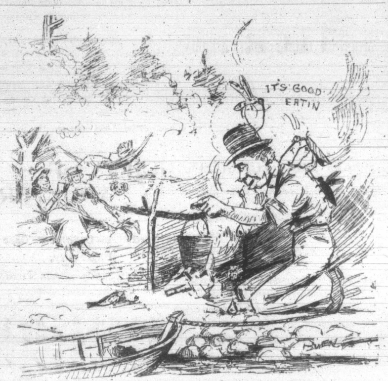
IN A MOMENT OF MENTAL ABERRATION THE STROLLER GOES- CAMPING.

friends on the police force he will that this species of argument will have In a moment of mental aberration manage to get thrown in for 24 hours any weight. We believe, on the control the Stroller consented last Saturday the next time an effort is made to use evening to join a party of three men, him as a tugboat on the Klondike.