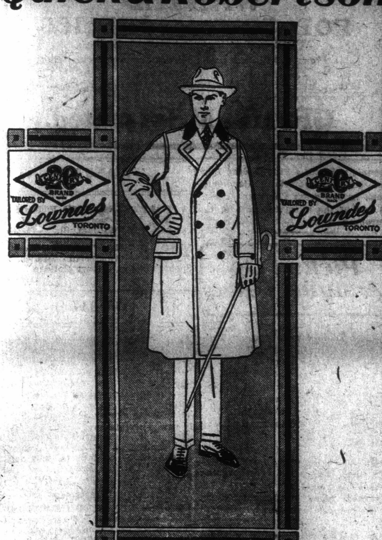
Ouick & Robertson Better Clothes