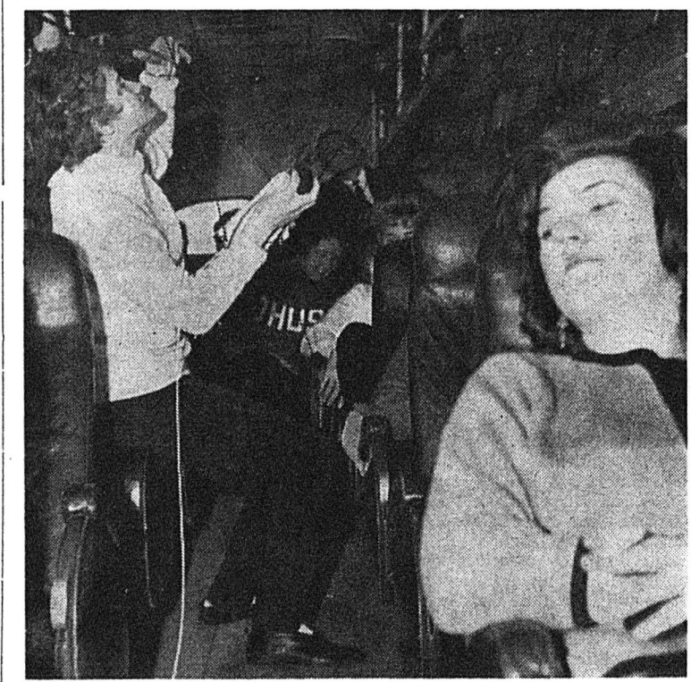
BUSILY RE-KNITTING a sweater demolished on Saskatoon trip, U of A co-ed finds that too many eager helpers can be a

REDUCED FARES-Students wishing with no admission charge. Everyone is welcome. Even YCF'ers. POLITICAL SCIENCE CLUB will hold a meeting on Thursday, Dec. 13 in West Lounge, 4:30 p.m. Model Parliament will REDUCED FARES—Students wishing to qualify for reduced fares on the train or bus during the Christmas season must obtain an official reduction certificate. These certificates may now be obtained from the Fee Clerk, 3rd Floor, Administration Building.