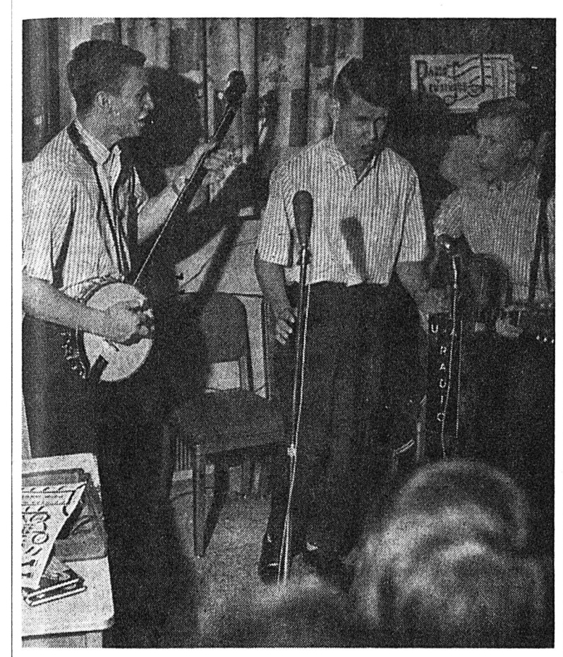
TRI-LITES "rock it up" at Friday night's first Radio Rendezvous. Successful event will probably become a Friday night