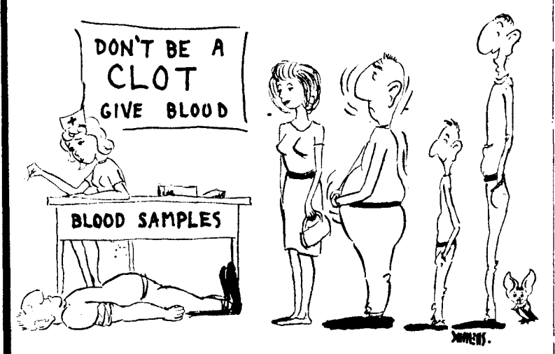
T WASN'T THE PIN; IT WAS THE SHOCK OF HER HOLD ING HIS HAND!