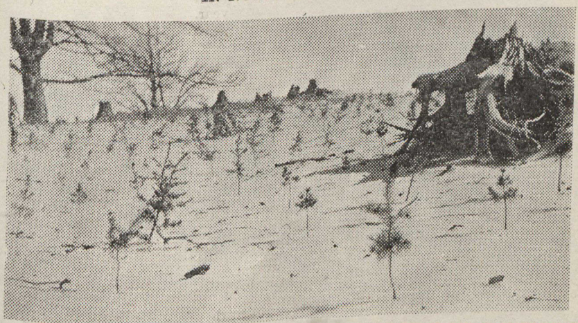
This gives an idea of how the soil has disappeared since the forest was cut away and shows how young trees are again taking root.