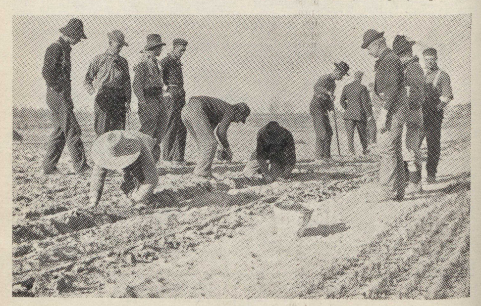
Planting Seedlings in Nursery Rows.

From these nursery beds hundreds of thousands of seeding trees go out to Ontario farmers and others. The demand is increasing year by year as the value of the work becomes known and the experiments which are constantly under way at the station are bringing together information that materially assists in the whole forestry movement. The trees set out in permanent location on the plantations include black locust, jackpine, Scotch pine and white and red pine, while experiments are also being conducted with ash, walnut, oak and butternut. It has been found that the black locust thrives best of all on these Norfolk sand hills, though jackpine and