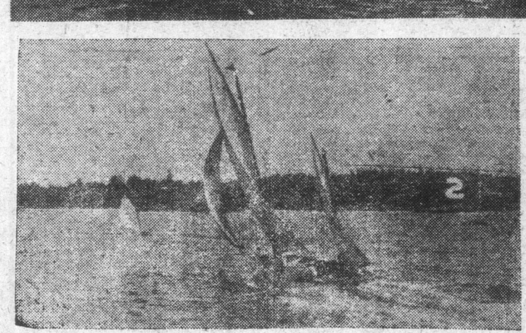
YAOHUING CARNIDAL. 1-Everett's Pride, "The Myth." 2-Homeward Bound