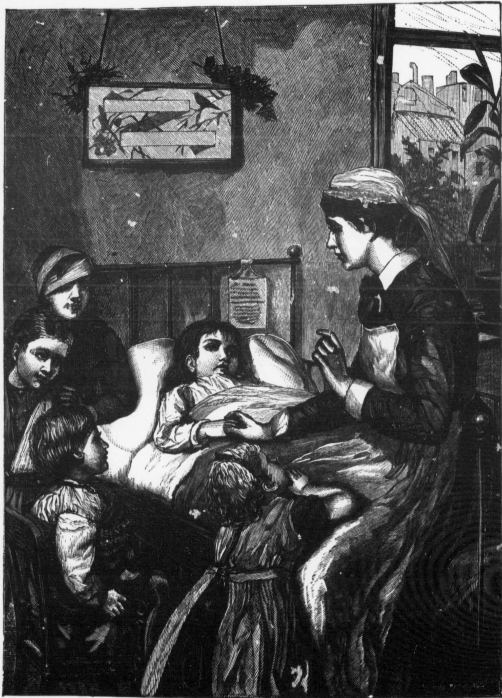
"CANADIAN CHILDREN'S HOME"