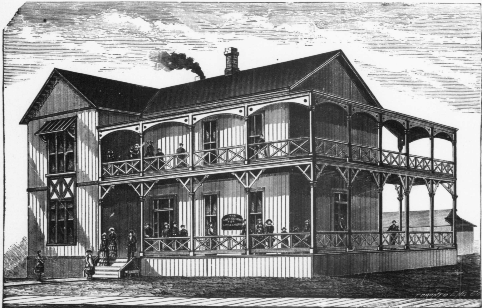
"LAKESIDE HOME," TORONTO ISLAND