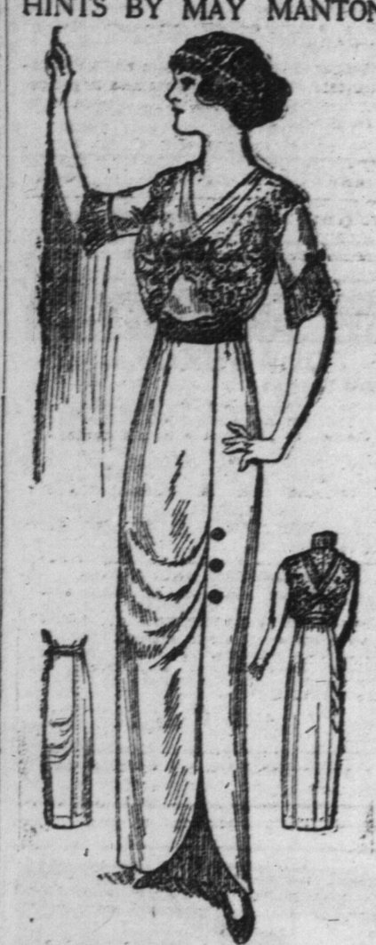
7863 Semi-Princess Gown, 34 to 40 bust.

(From The Family Physician.) Beauty devotees are enthusiastic over the beautifying qualities of mercolized wax. Perhaps the most discovered within recent years accomplishes so much so quickly, without harm, without detaining the system, and without causing such a principal reason for its wonderful merit is that it works in harmony with the physiological process of the skin, instead of hindering or opposing it. The wax actually takes off the aged, faded, sunken, freckled or blotchy skin, gently, gradually, causing no inconvenience. It is Nature's way of removing impurities, and when the natural process is retarded because of deficient circulation or nerve tone, mercolized wax comes to the rescue and hastens the skin shedding. The new complexion which appears is a natural one, youthful, healthy, exquisitely beautiful. If you've never tried mercolized wax, get a ounce of it at the drug store, use at night like old cream, washing it off in the morning. Another natural beautifying treatment—for wrinkled skin—is to bathe the face in a lotion made by dissolving an ounce of axolite in a half pint with hazel nut oil.