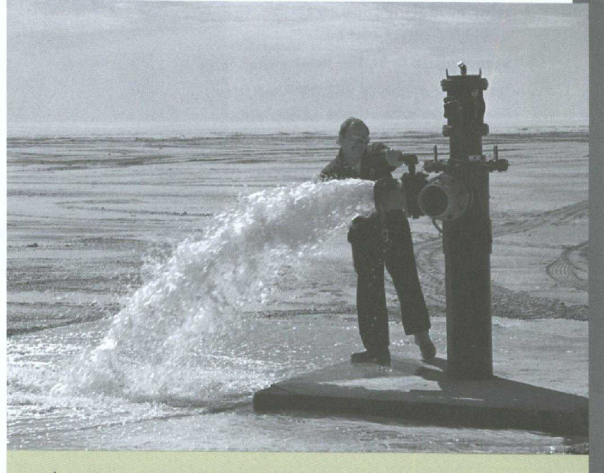
It's no mirage: SNC-Lavalin dug 700-metre-deep wells in the Saharan desert to tap Libya's aquifers. Opportunities abound for other Canadian firms.

In 2000, after early success in the U.S. market, Ontario-based Pressure Pipe