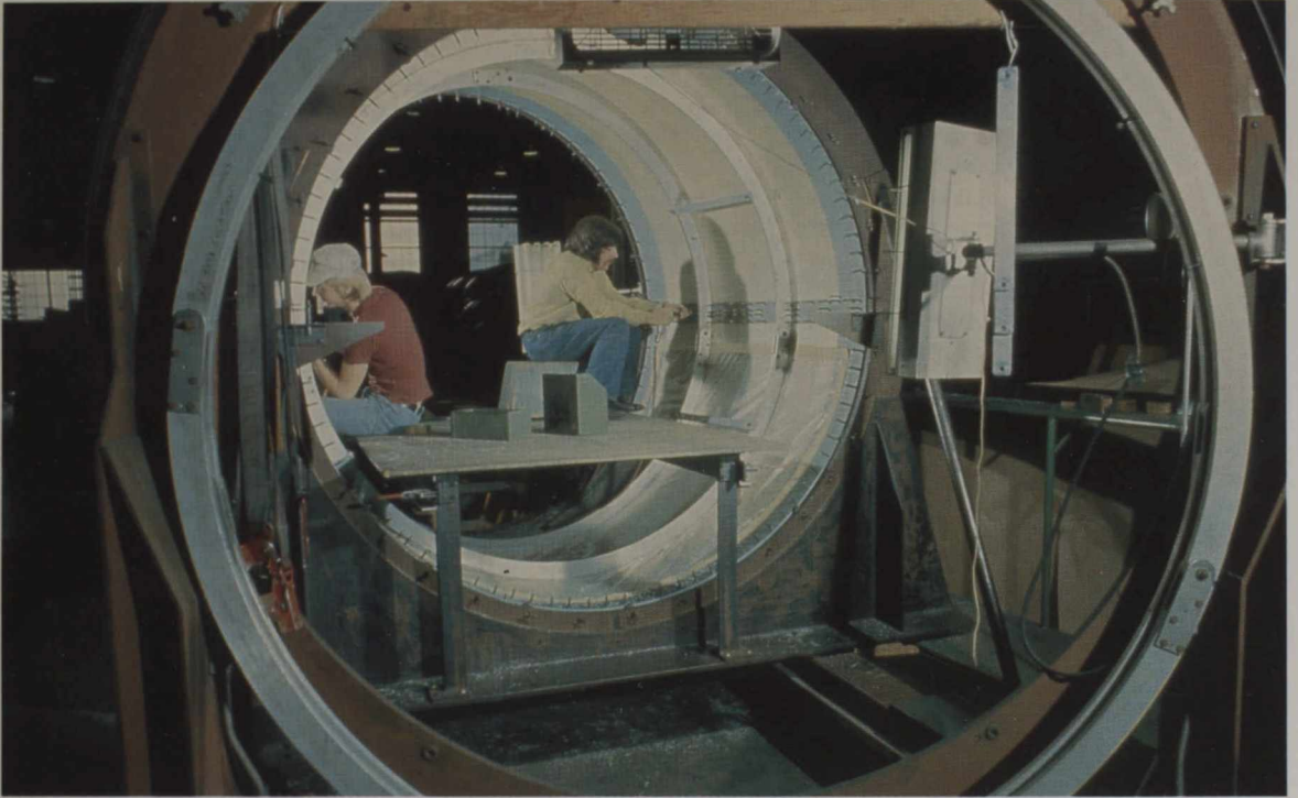
Lockheed assembly plant in Winnipeg.

The cost of living is relatively cheap; Manitoba had a 10.9 per cent inflation rate last year, compared with 12.5 for all Canada. This year it is expected to fall slightly.