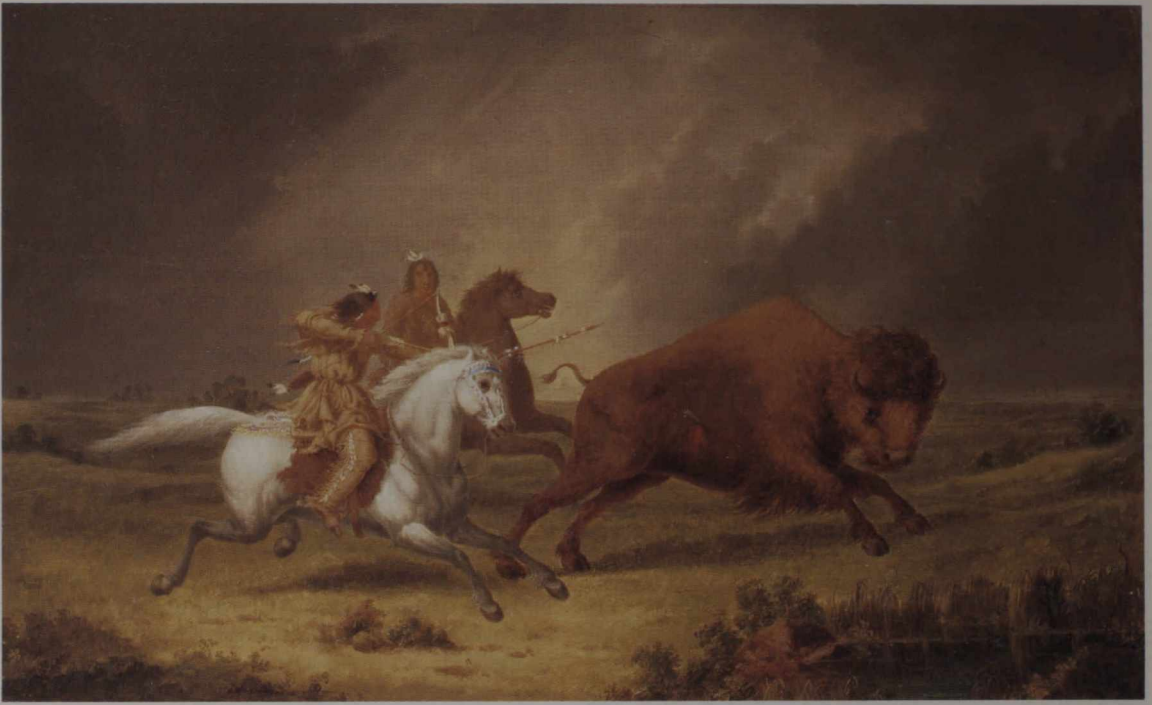
Paul Kane: Assiniboine Hunting Buffalo. Ontario Artist Paul Kane wandered through Canada's West from 1846 to 1848, sketching the Indians.