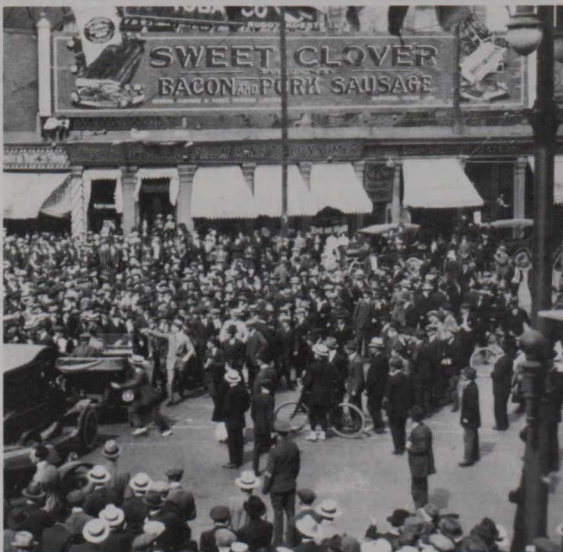
Winnipeg General Strike, June 10, 1919.