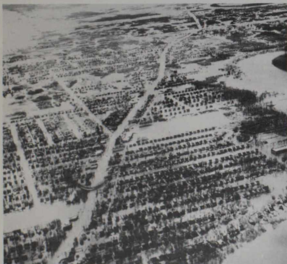
The 1950 flood.

Winnipeg was once described by a native as "one hundred and fifty dollars away from anything." He went on to say that "we figured we'd just have to do these things ourselves."