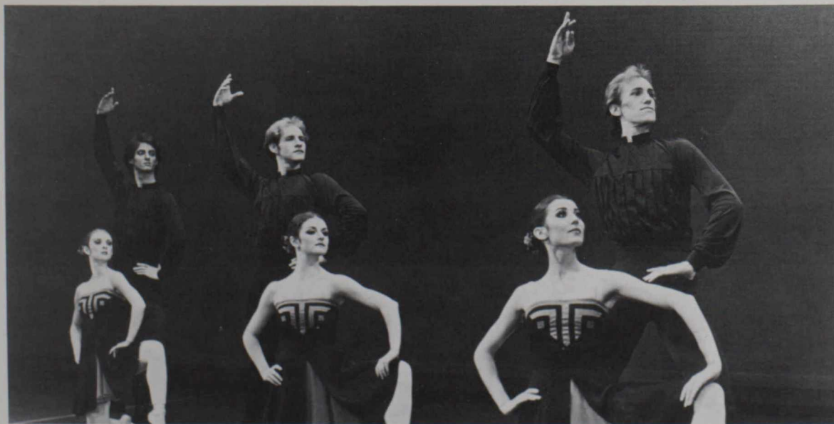
The Royal Winnipeg Ballet in Five Tangos