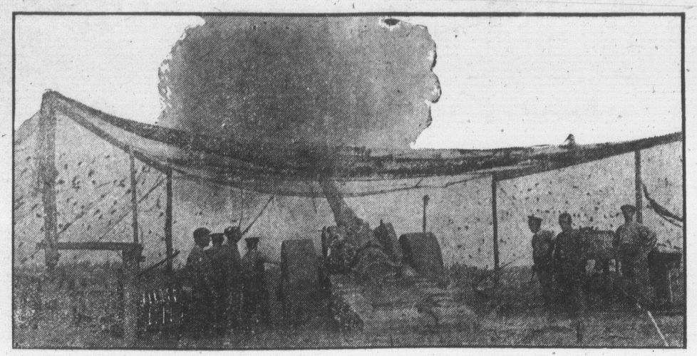
On the British Western Front in France .- Firing a long range gun.