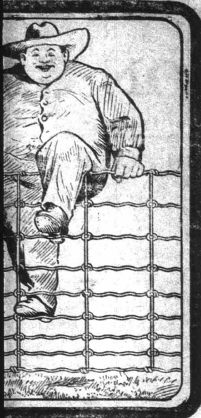
ST. ANDREWS, N. B.