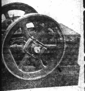
S. 11-2 TO 8 H. P.