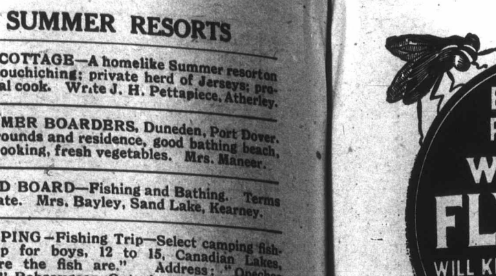
Clean to h