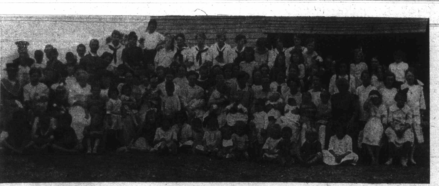
CAMP OF SOLDIERS' WIVES AND CHILDREN, 1916.

To a man at work the frost is but colour; the rain, the wind, he forgot them when he came in.—Emerson.