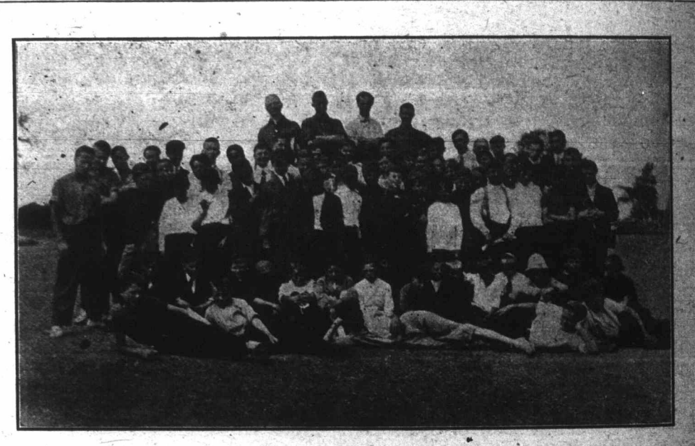
BEFORE THE WAR.

group in the right direction, may attain the red ribbon. This is the Camp's highest honour, and one greatly coveted. But a boy is not yet trained to meet life's contingencies until he is an acceptable member of society. Hence the group system. Either during the period of organization or upon arrival at Camp, the Campers are divided into groups of ten or a dozen. Each group then be-gins a spirited competition for the honour pennant. The final award of