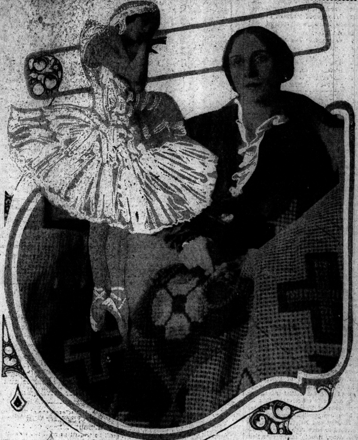
Mrs. Anna Pavlova, the famous ballerina, in two distinguished poses. In the upper left hand she is shown in one of her well-known Ballet Poses. In the other picture Pavlova is shown weaving a rug for her church in Russia.

PAYLOWA PLIES NEEDLE TO QUIET NERVES WEAVES CARPET FOR CHURCH IN RUSSIA