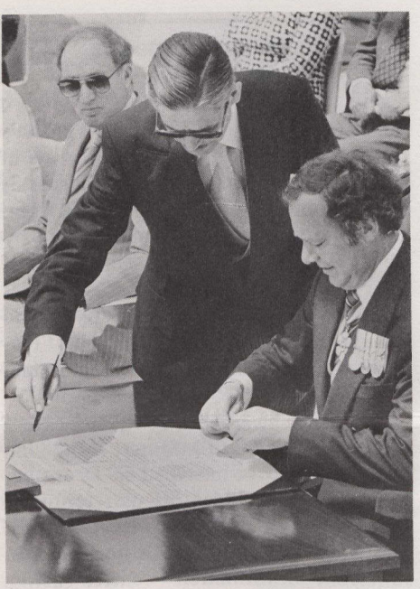
Governor-General Schreyer (right) signs the royal proclamation as Prime Minister Trudeau (far left) watches on.

"At the same time as we are celebrating Canada's birthday we should send special