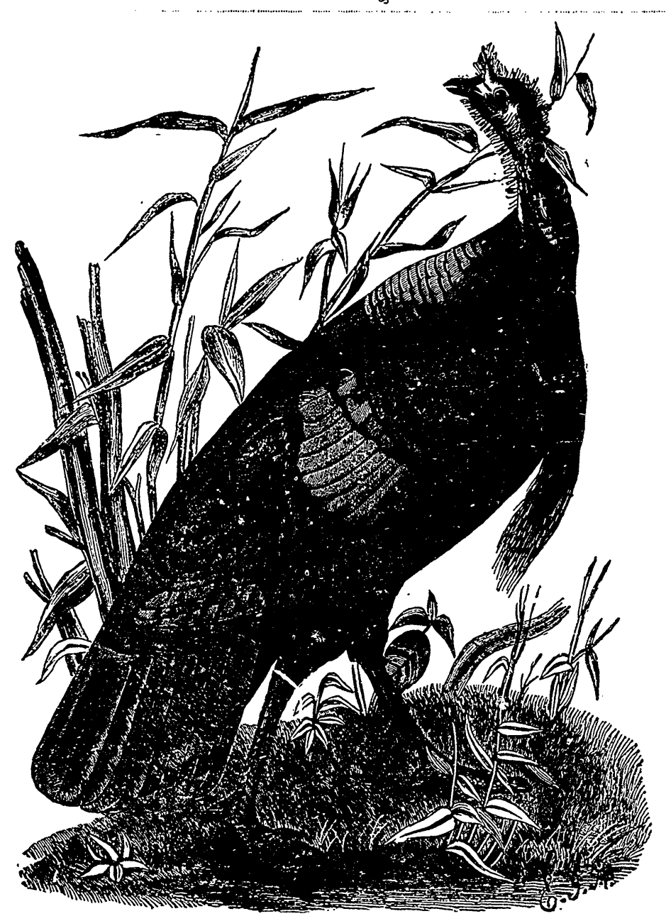
THE WILD TURKEY-A GAME BIRD OF NORTH AMERICA.

world is indebted to America for this magnificent was served up at the banquet given at the wedding bird. It was first introduced by the Spaniards from of Charles the IXth, in 1570. Bred with much Mexico into Spain, and thence into England. In care they rapidly increased and soon were taken the reign of Francis the First they were imported into Asia and Africa. It would be difficult to ascer-