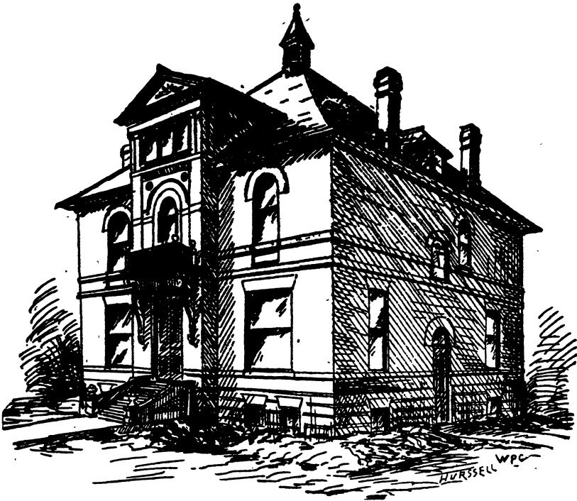
THE WOMAN'S HOME

The Christian Woman's Union owes its origin, in March, 1883, to a few devoted women whose strong desire was to bring together women of different Protestant denominations and varied predilections and to unite them in some important work in which they could all be interested. The proposed