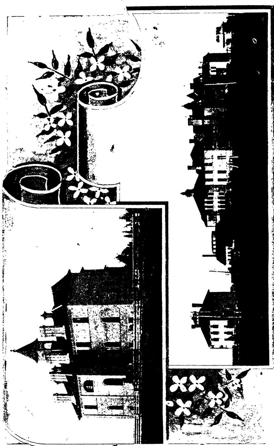
WINNIPEG GENERAL HOSPITAL