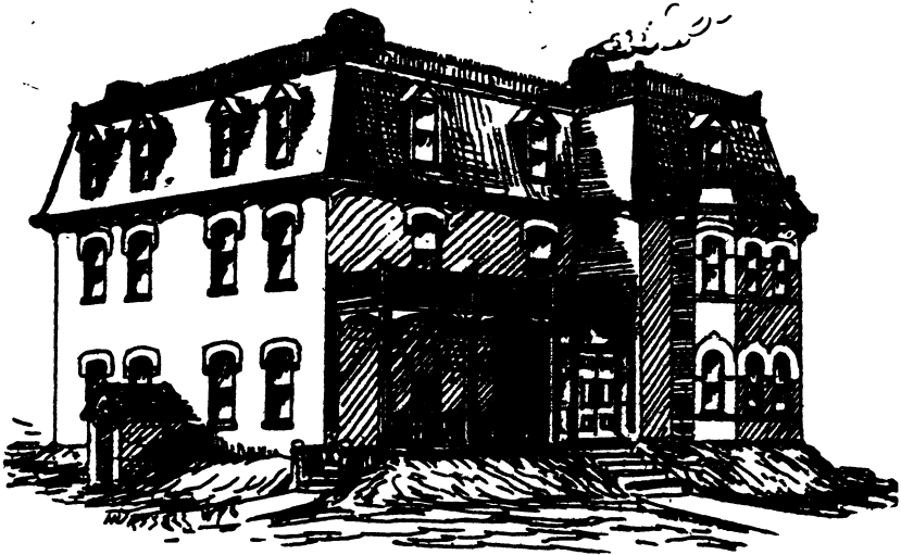
THE CHILDREN'S HOME

factory, an indenture, in duplicate, is signed by the contracting parties. The children must be well clothed and sent to school for a certain number of months in the year. Payments of five dollars per year are required until the child is 16 years old; fifteen dollars when the child shall have attained the age of 16 and twenty dollars when the child is 18 years of age. This sum is payable to the child, by the corporation, when the guardianship of the home ceases. A written annual statement of the condition and welfare of the