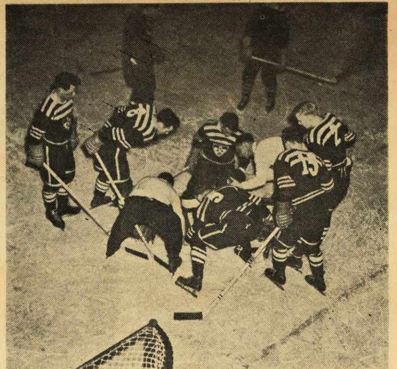
SPEAK TO ME seems to be what the group of St. Mary's players are saying as they bend over their unconscious team-mate. Note the concern of officials and St. Mary's players over the fallen player and the utter lack of interest shown by the two unidentified Dalhousians. After the interruption St. Mary's went on to defeat Dal 7-4.