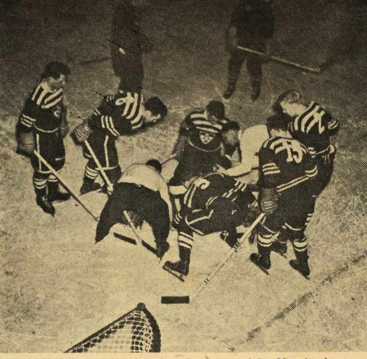
SPEAK TO ME seems to be what the group of St. Mary's players are saying as they bend over their unconscious team-mate. Note the con-cern of officials and St. Mary's players over the fallen player and the utter lack of interest shown by the two unidentified Dalhousians. After utter lack of interest shown by the two different Dal 7-4. the interruption St. Mary's went on to defeat Dal 7-4.