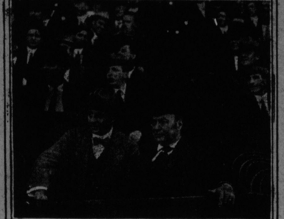
VICE-PRESIDENT SHERMAN AT THE BALL GAME. Vice President Sherman, "Sunny Jim," as he is affectionately called, is a baseball fan of the most rabid kind.