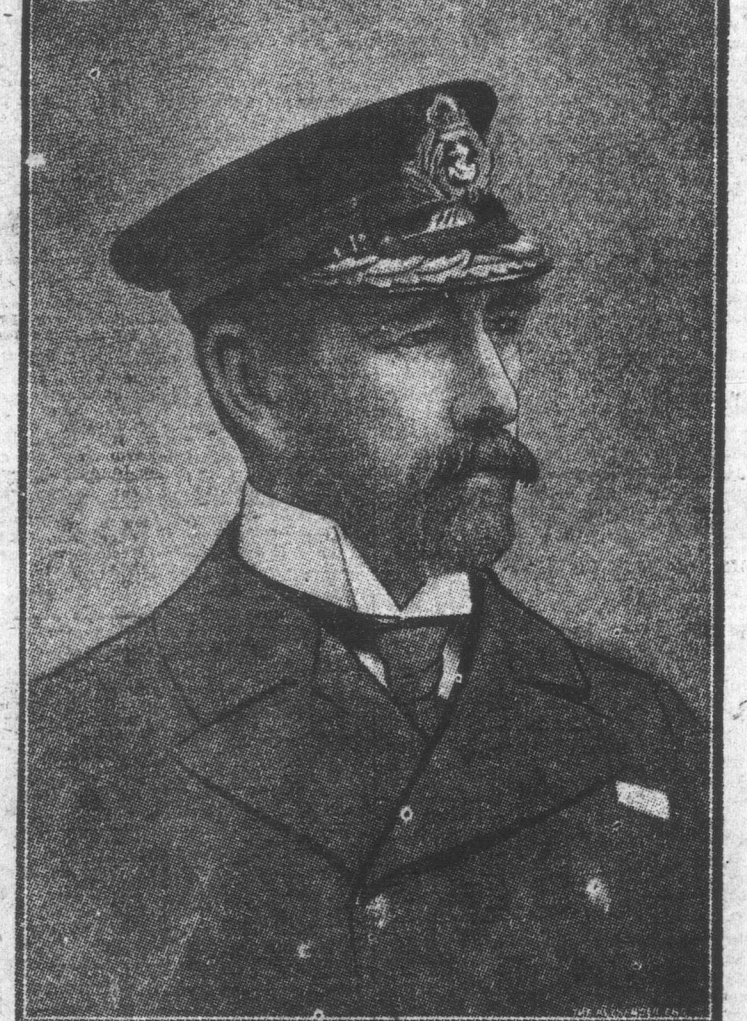
REAR ADMIRAL KINGSMILL, NOW ON THE INSPECTION TOUR.

London, Sept. 9.-Daniel McKeever, 1 hand one of the big fish such as he has seen in the shops in the east. The appointment of Admiral Kingsabove the heart, causing instant death.