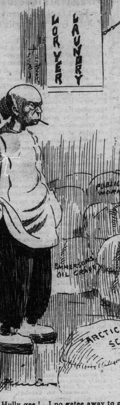
LOR YER (an esthetic "Chink"): Hully gee! I no gettee away to gathel apple blossoms lis spiling.