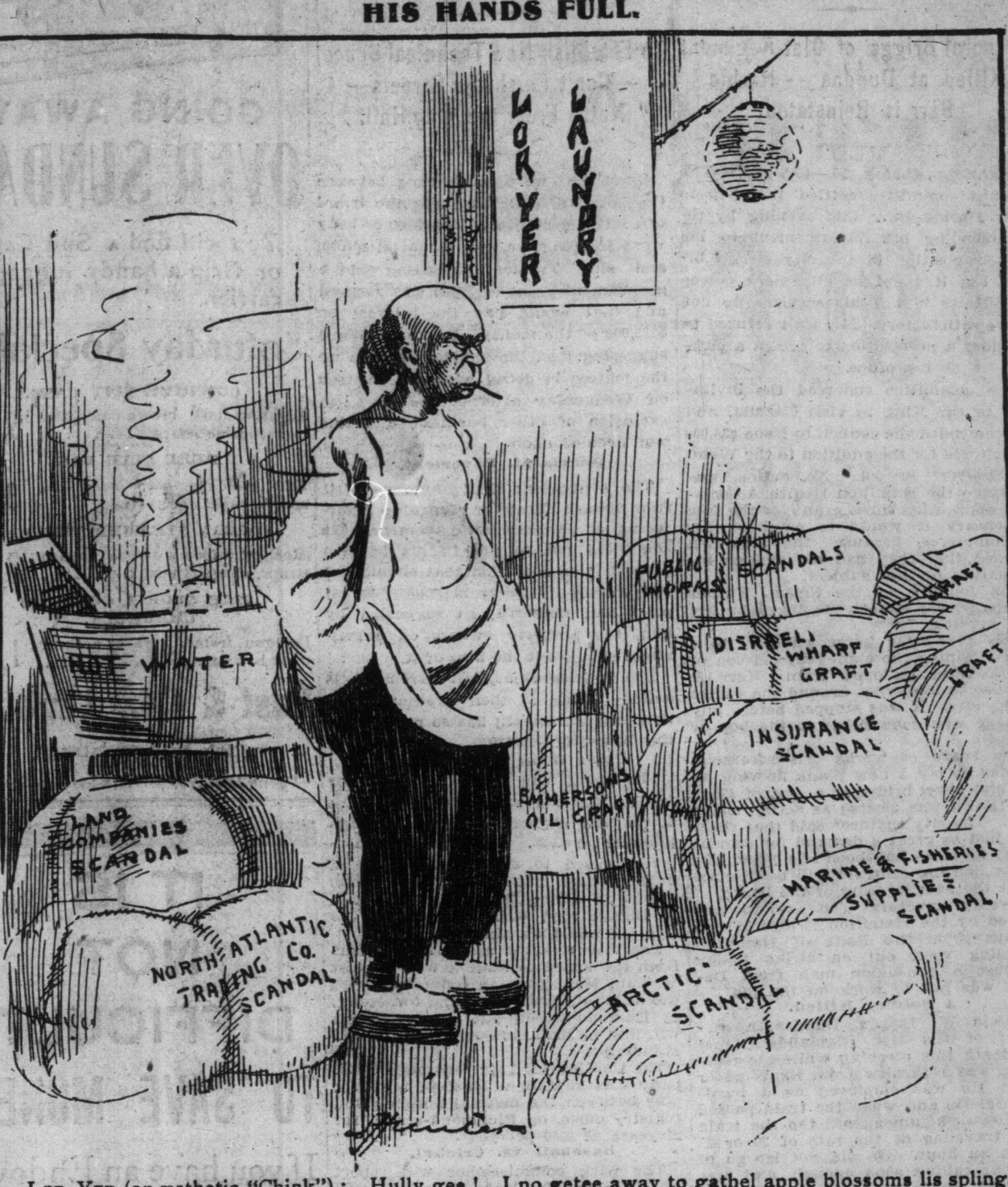
LOR YER (an esthetic "Chink"): Hully gee! I no gettee away to gathel apple blossoms lis spiling.

The princess was installed in a luxurious coach, which had been reserved for her. The young king then conducted the princess to the royal train, where the princess was installed in a luxurious coach.