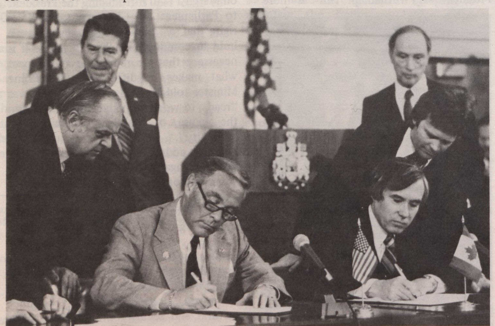
U.S. Secretary of State Alexander Haig (left) and Secretary of State for External Affairs Mark MacGuigan (right) sign the Social Security Agreement in the presence of Prime Minister Trudeau and President Reagan.

The Prime Minister also said that Canada was "disappointed" the East Coast fisheries resources agreement had been withdrawn from the United States Senate where it had been awaiting ratification since March 1979. However, the Prime