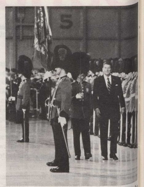
President Reagan reviews the guards of the 22nd Regiment upon his arrival in Ottaw

Minister said he was "happy that the United States administration had under taken to assure fish conservation measure in that area" and was "hopeful" that the problem would be settled in that way.