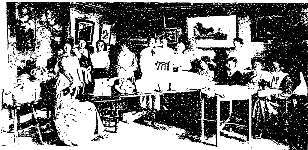
St. John Working Committee