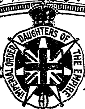
PEACE RIVER AND DISTRICT