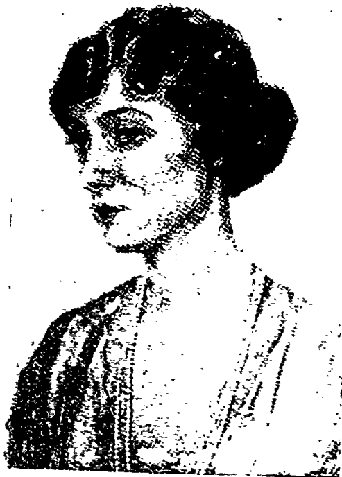
Princess Patricia of Connaught