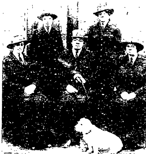
Officers of The Canadian Field Comforts Commission Shorncliffe, England