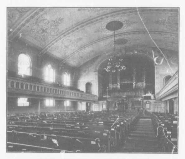
INTERIOR, AUDITORIUM, THE CENTENARY CHURCH