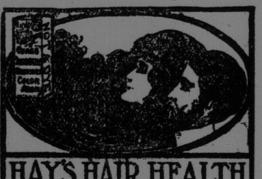
Exhibit at Fair.