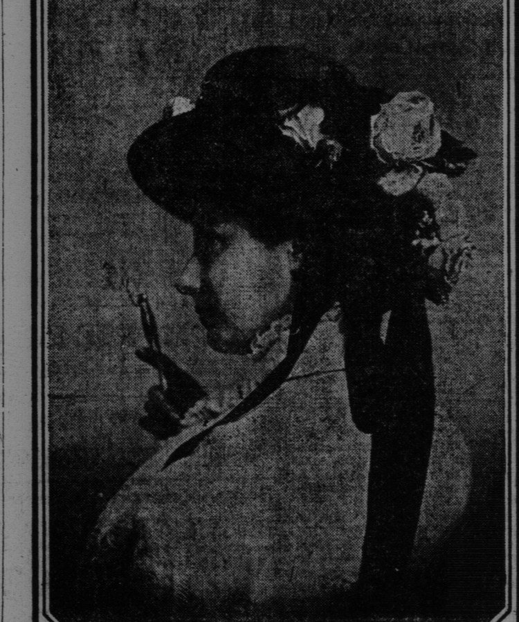
ATTRACTIVE TRIMMING SCHEME. The trimming of this spring chapeau is the feature which places it among the novelties in the new millinery. It is a small, narrow-brim, rather high-crowned shape of black Venetian straw, handed with wide black velvet ribbon, which is drawn down over the back brim to mingle with a full bunch of pink silk roses, full blown and buds. Loops of the velvet depend from the back band and over the shoulders. On the right side of the narrow brim is a single half-blown rose, and its foliage posed in a pretty, careless fashion.